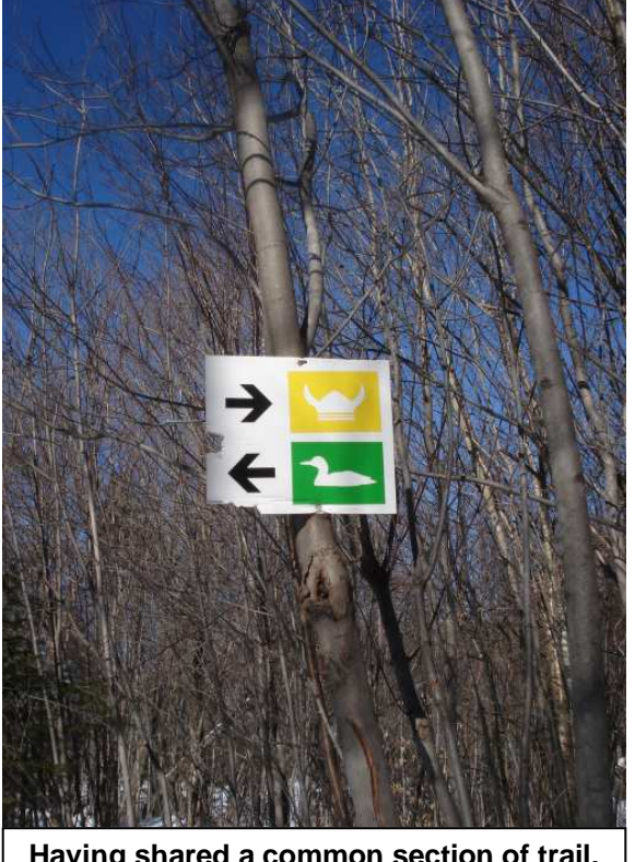
Having shared a common section of trail, the Loon and the Viking must now part ways!

Here we traverse Lac Henri and head north, on the Viking South!