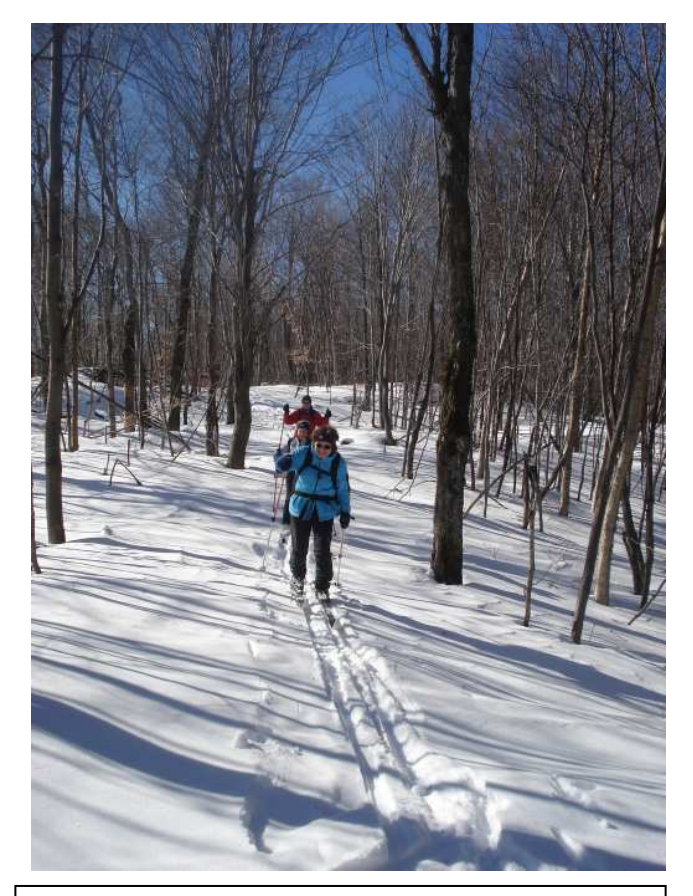
At junction no. 5 on the LND loop, the group splits with one group exploring a new extended and remote southern routing which links back into the Viking Crown South trail.