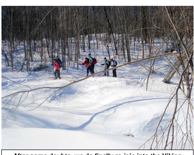
After some doubts, we do finally re-join into the Viking Crown South trail...... and celebrate by having lunch!