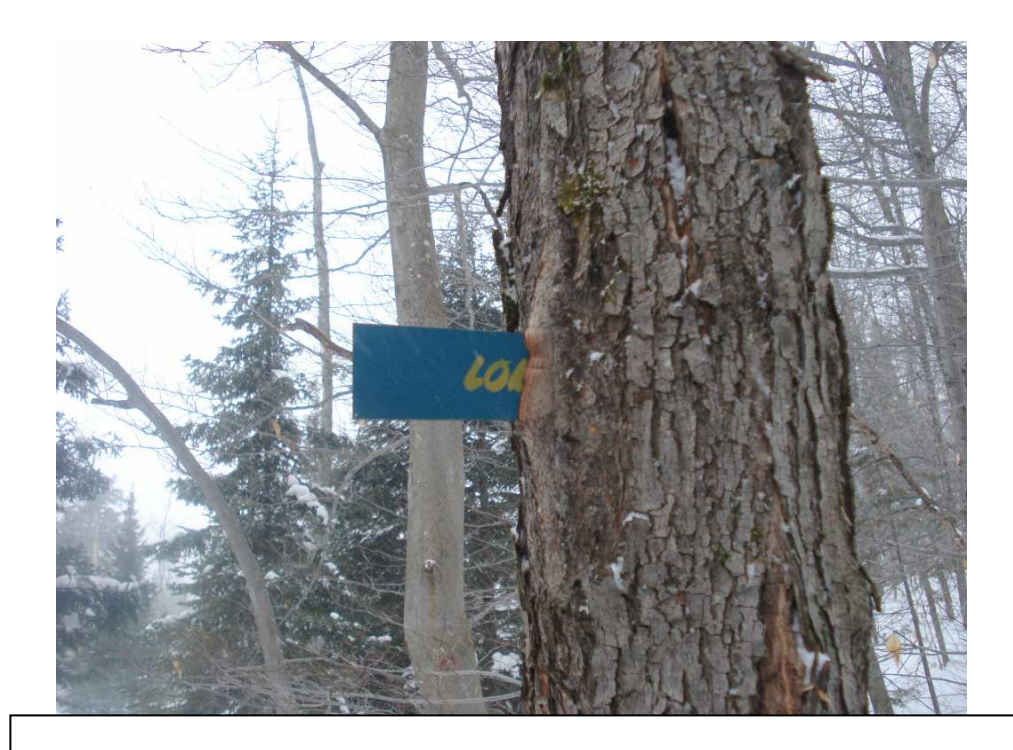
As if it were not frustrating enough that land owners were swallowing up sections of the Loken trail; the trees were also swallowing up the Loken trail signs!!