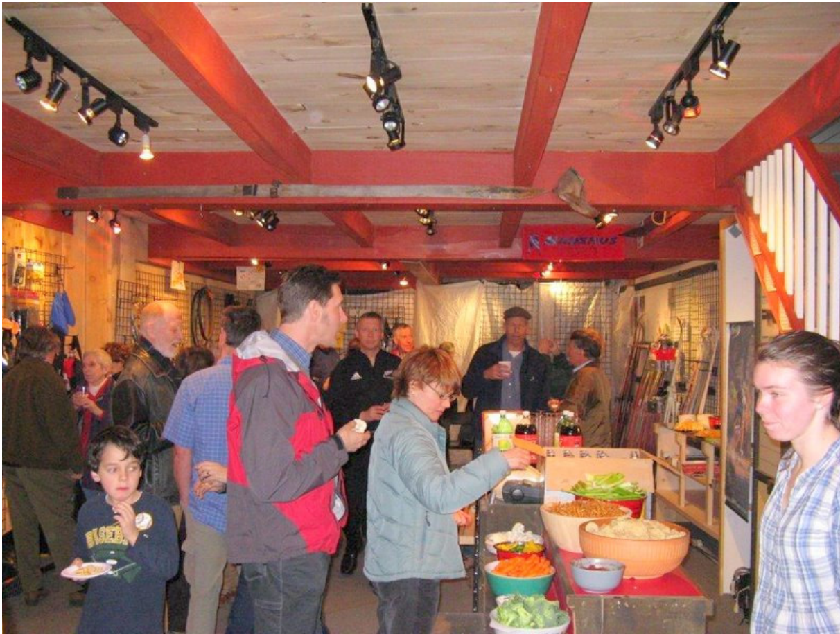
Noraaay Nordic closing party. Below: Some skiers think that they can fly!