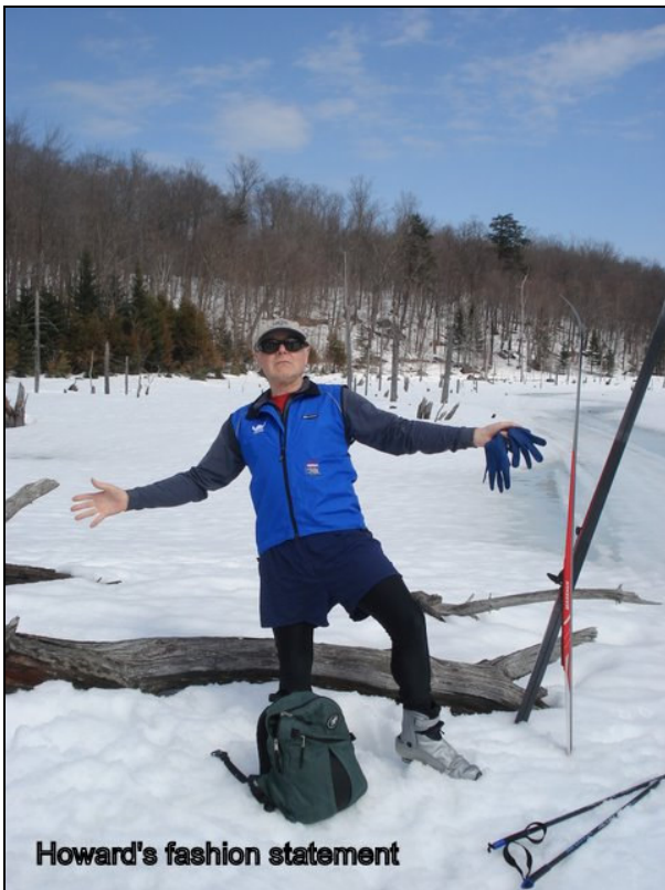
Howard's fashion statement