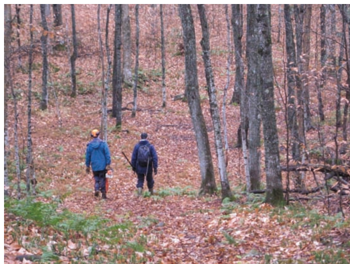
Trail clearers walking in a sea of leaves on Blue Trail just south of Point J1.